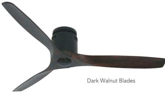
Dark Walnut Blades