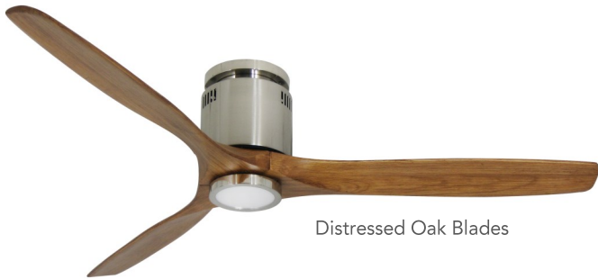
Distressed Oak Blades